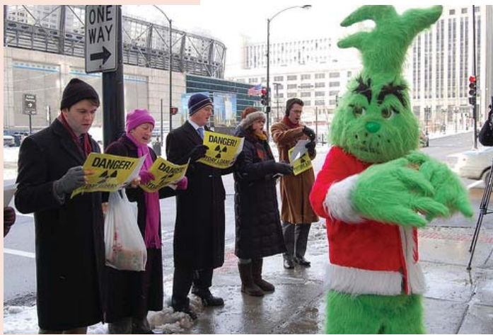
“Woodstock staff and other consumer advocates hold a holiday event warning potential customers about the dangers of payday loans.”

state law, are failing to verify borrowers' ability to repay the loans, allowing for multiple rollovers, and imposing balloon payments. Although the banks' fees are somewhat lower than those charged by storefront payday lenders, the banks' payday loans can cause even more harm to borrowers because banks have direct access to their customers' bank accounts. They can extract funds regardless of the account balance, and unilaterally prioritize repayment of the payday loans over their customers' other bills, such as rent and utilities, and trigger overdraft fees. These practices often lead bank payday loan borrowers to take out another predatory loan – either at the bank or elsewhere – to pay off the first loan. Additionally, banks do not enter loan information in IDFPR's database, effectively skirting state oversight and enforcement.